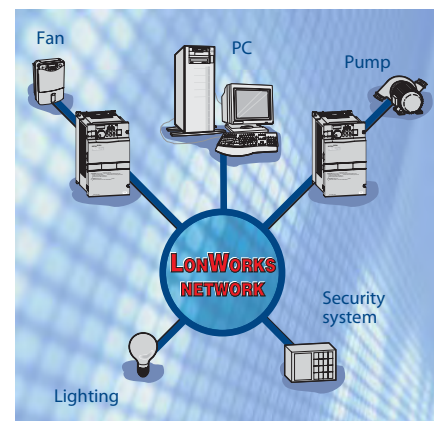
The FR-F740/F746 in a LonWorks network system