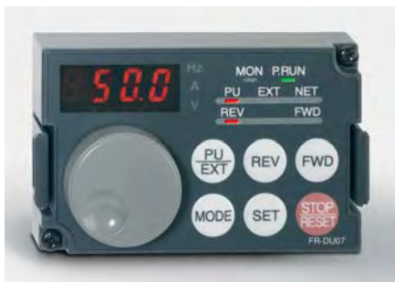
Control unit FR-DU07