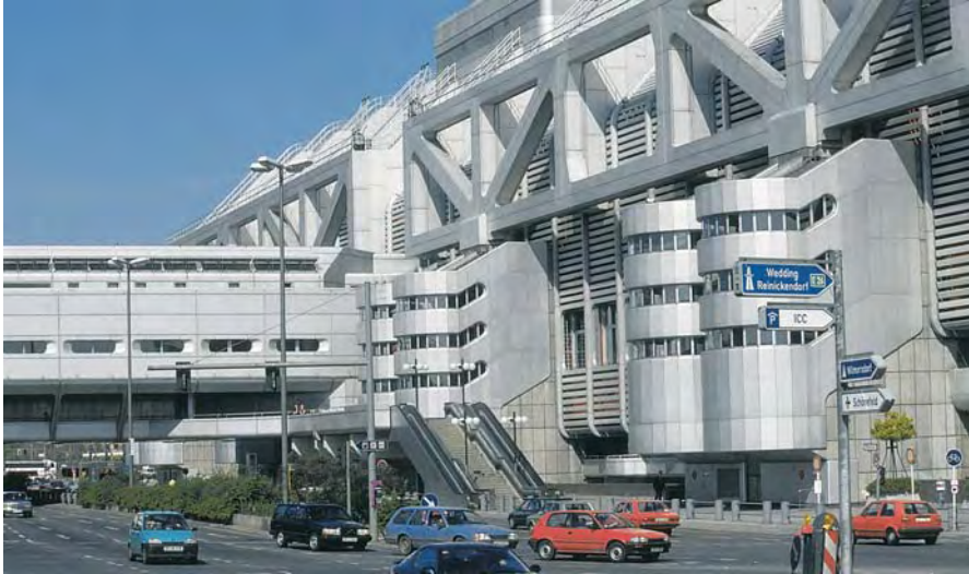
Complex HVAC building services automation solutions