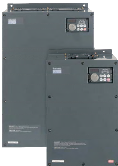
Frequency inverter FR-F746

Mitsubishi Electric's drive systems have an enviable reputation for reliability. The recent customer satisfaction survey conducted by IMS Research confirmed that the inverter drives made by Mitsubishi Electric are among the best in their class.